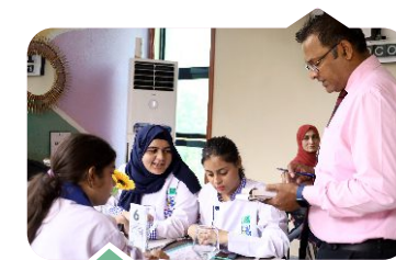
FIKA Where Training Meets Taste