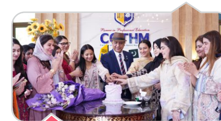
Women of Strength She leads: Shaping the Future of Pakistan